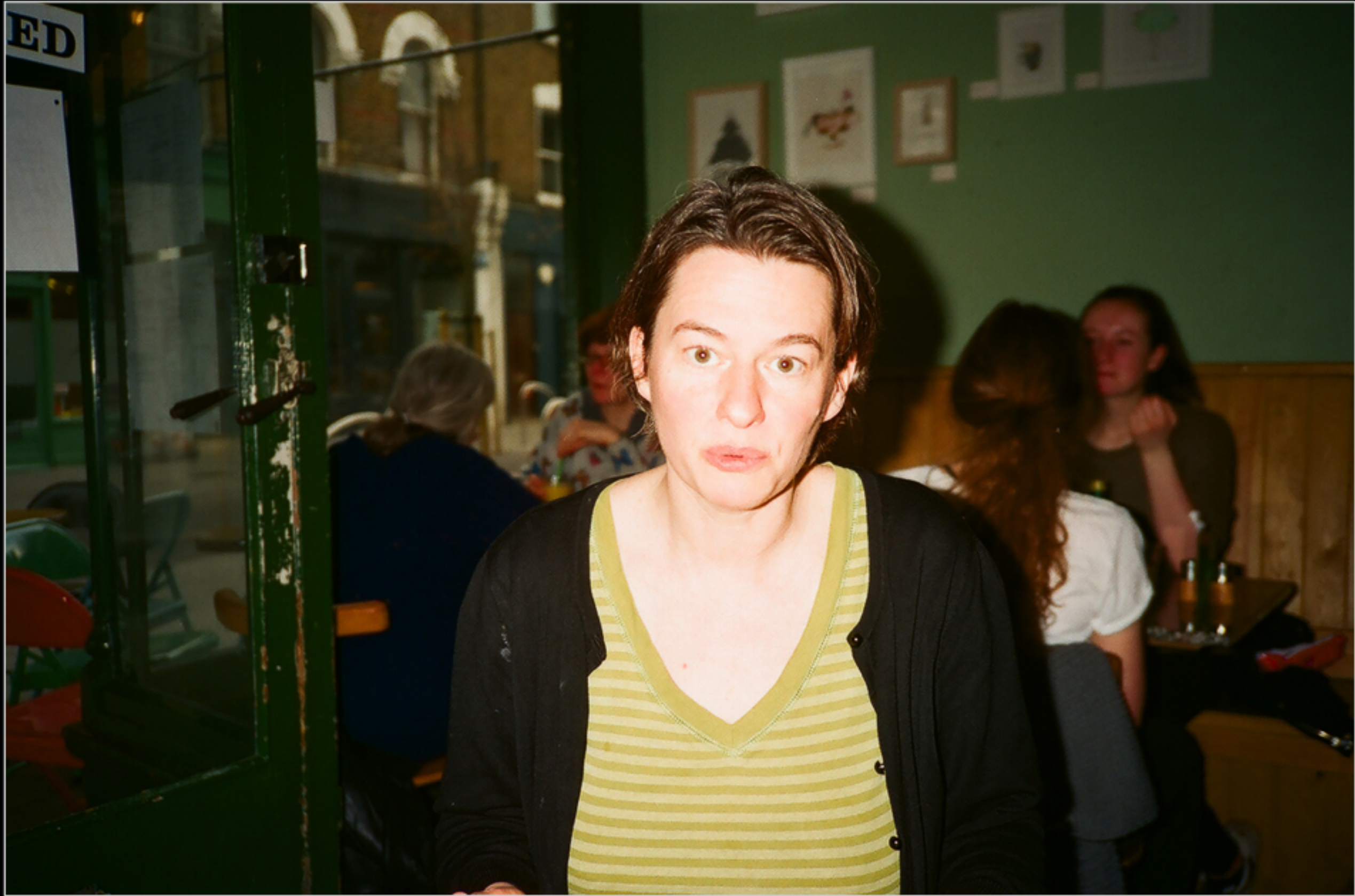
Walthamstow, London; 8th April