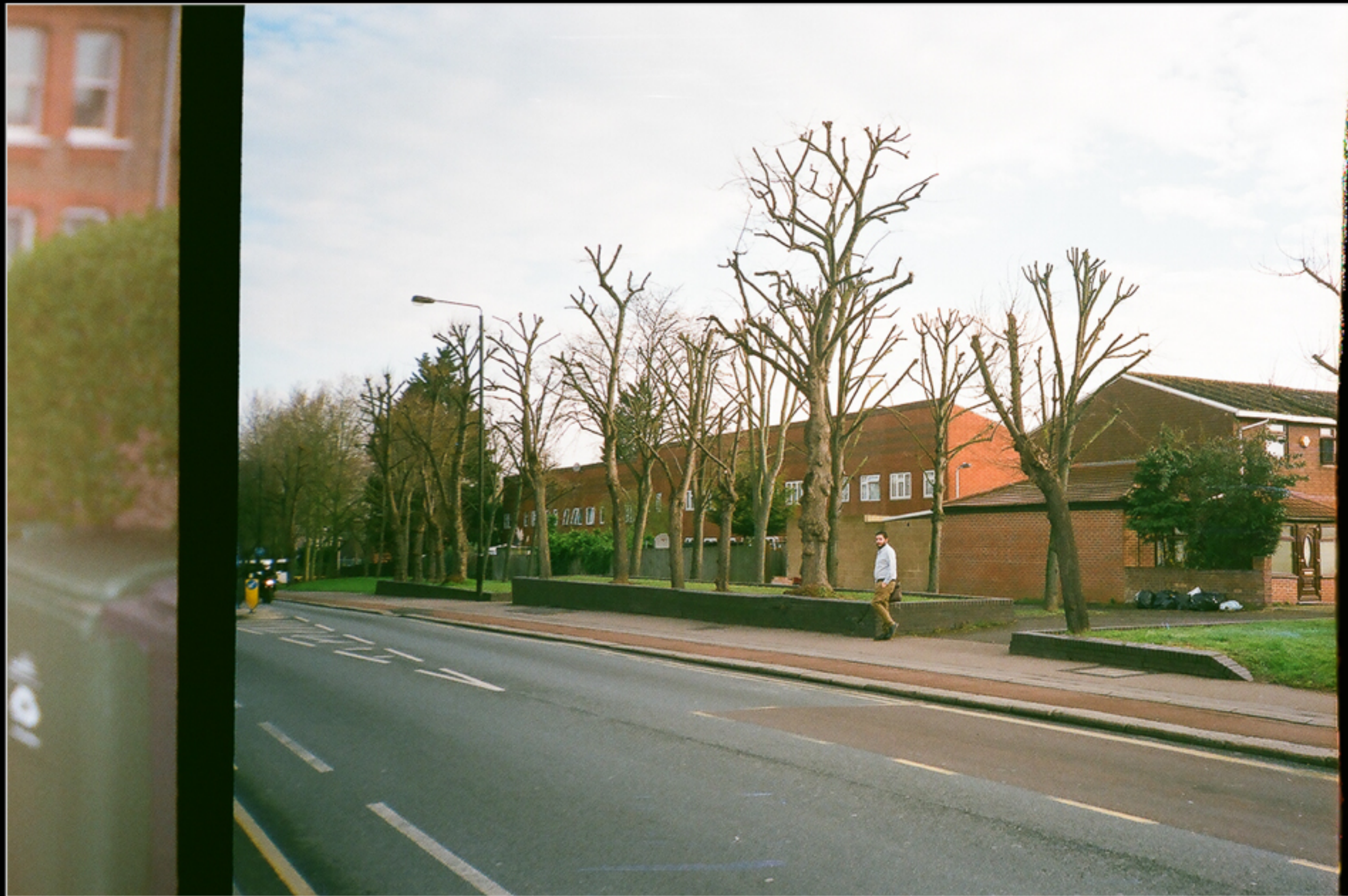
Walthamstow, London; 13th April