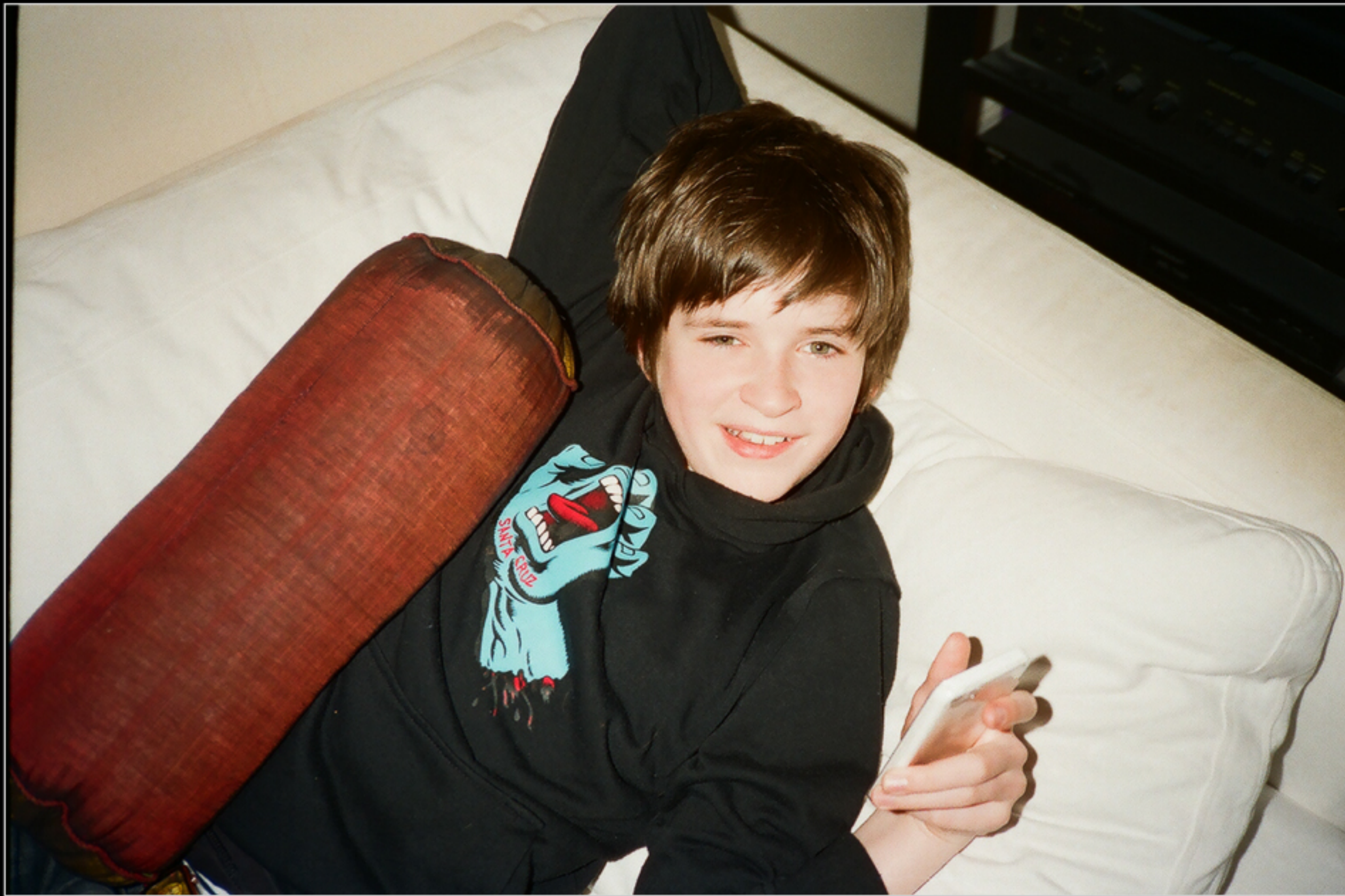
Walthamstow, London; 8th April