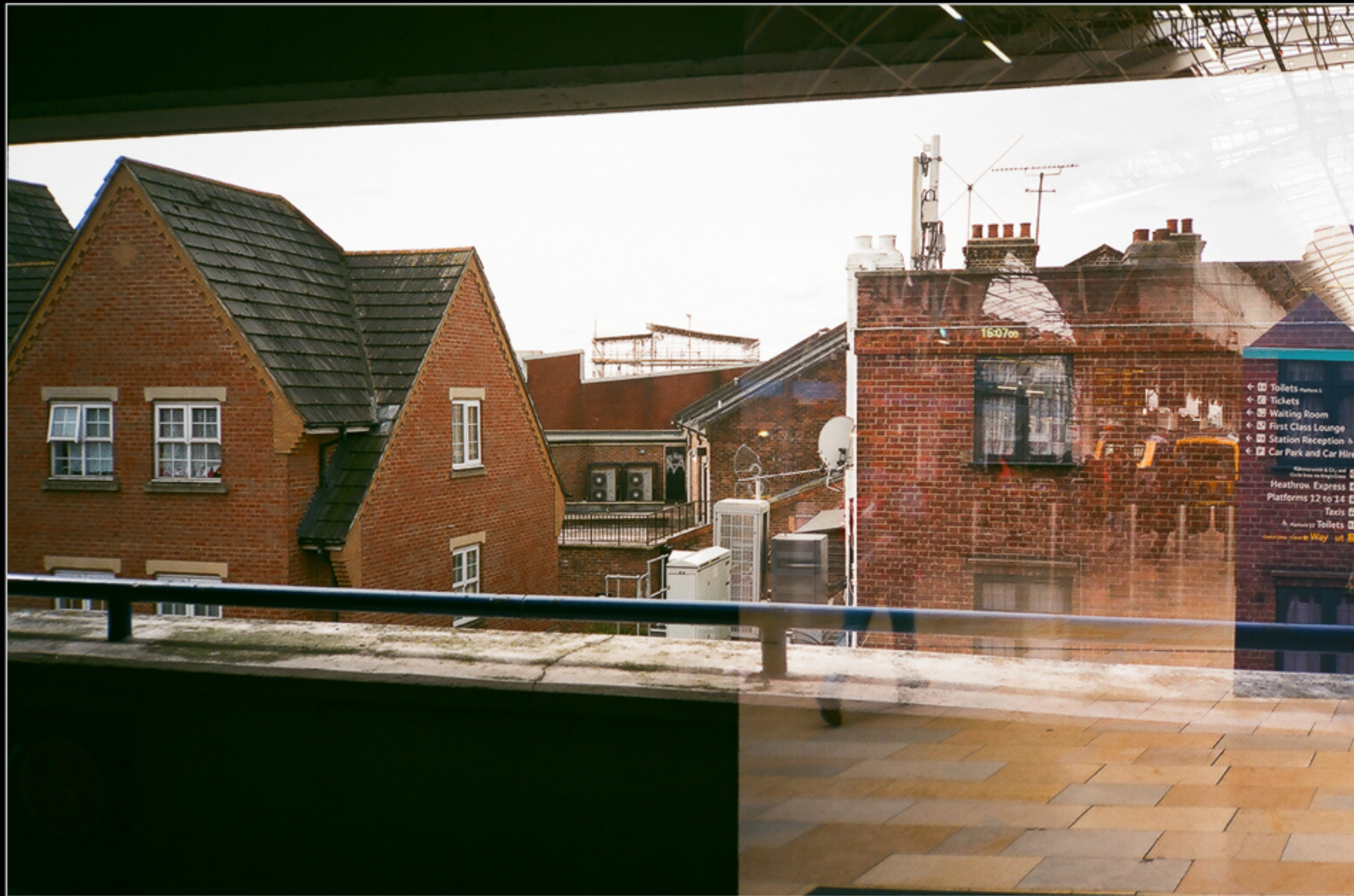
Walthamstow, London; 10th April