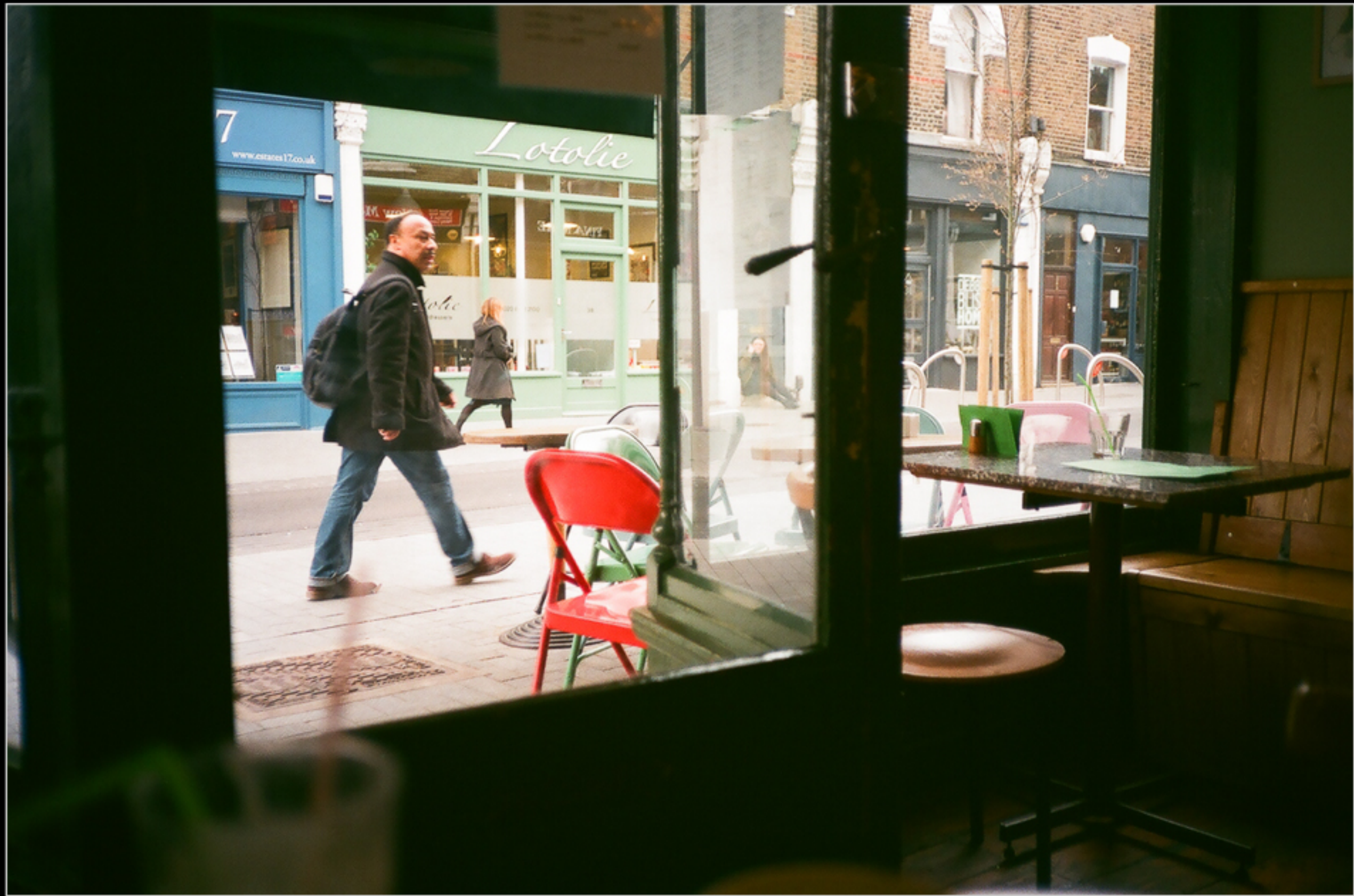
Walthamstow, London; 8th April