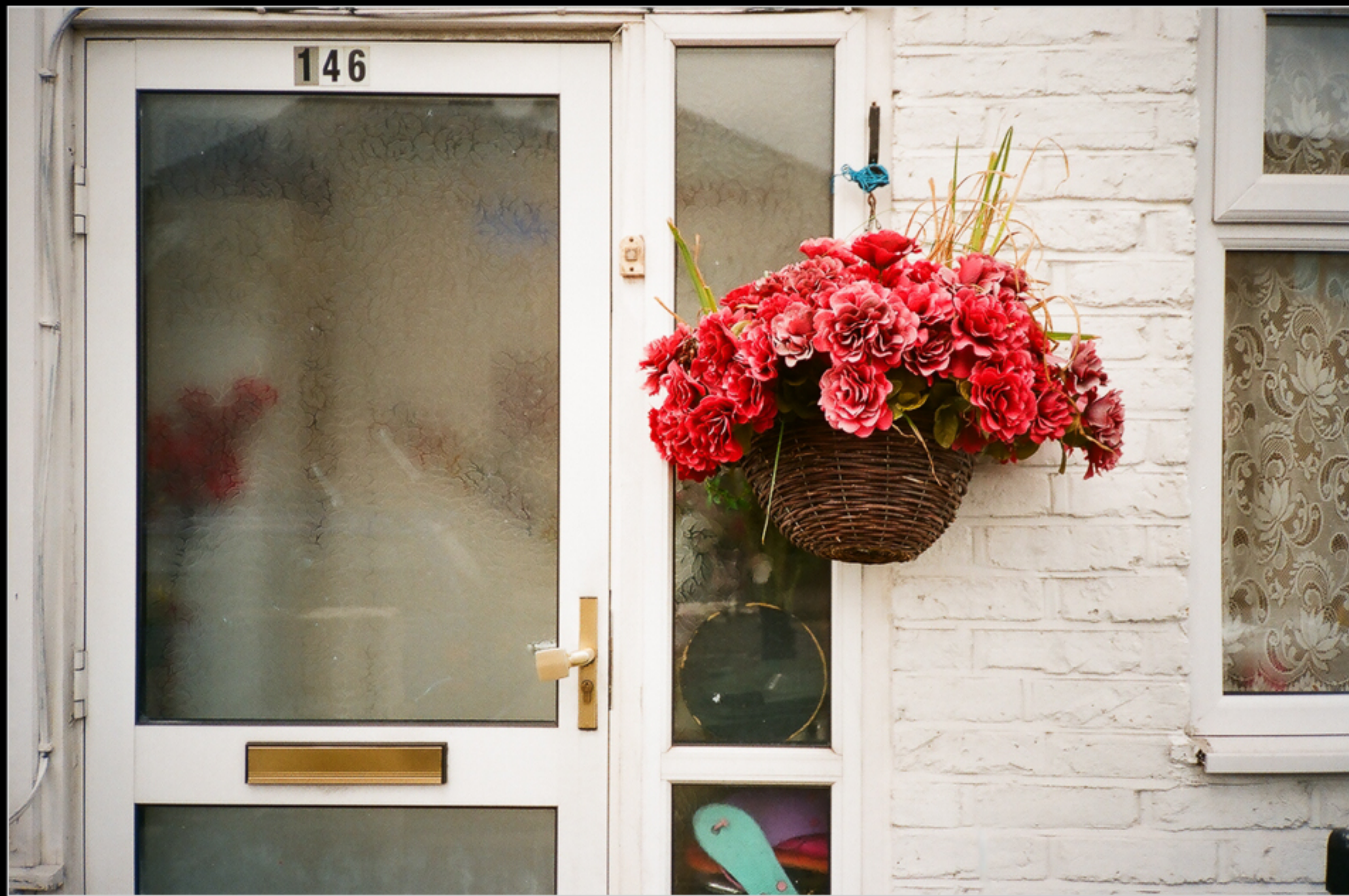
Walthamstow, London; 8th April