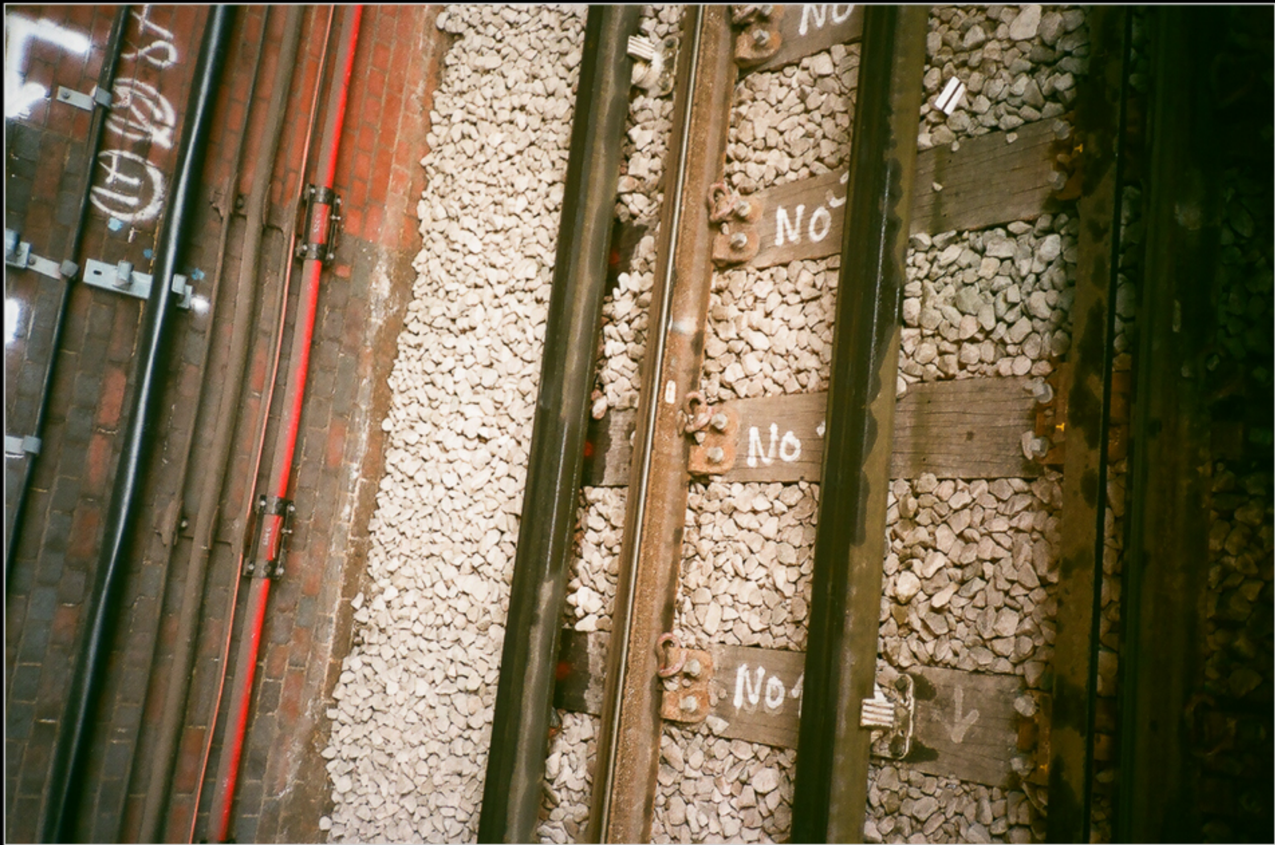
Paddington, London; 11th April