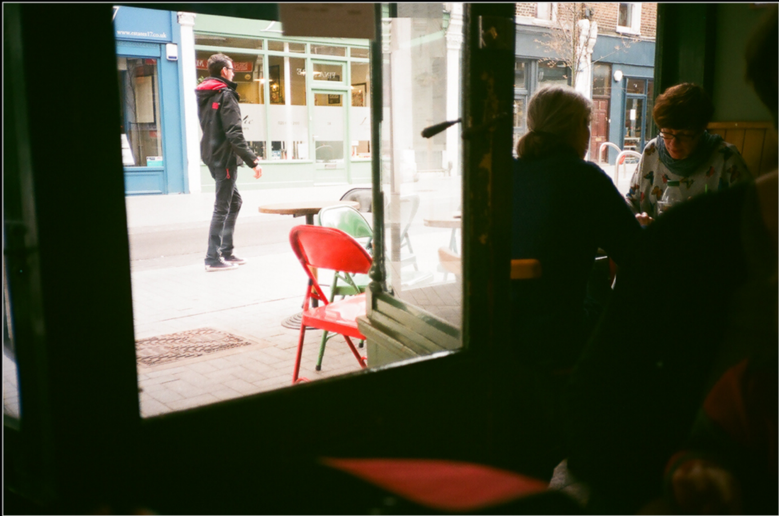
Walthamstow, London; 8th April