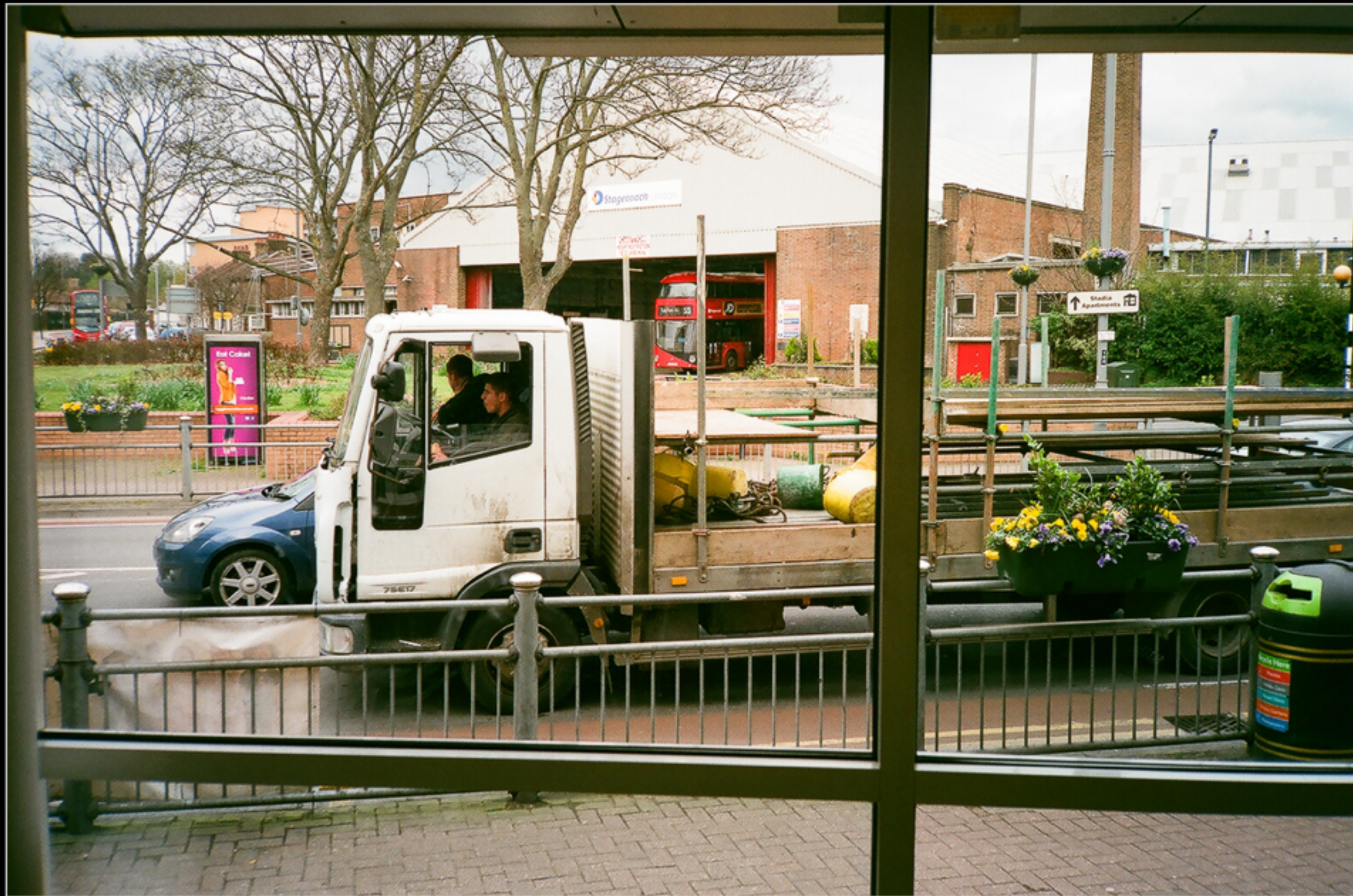
Leyton, London; 9th April