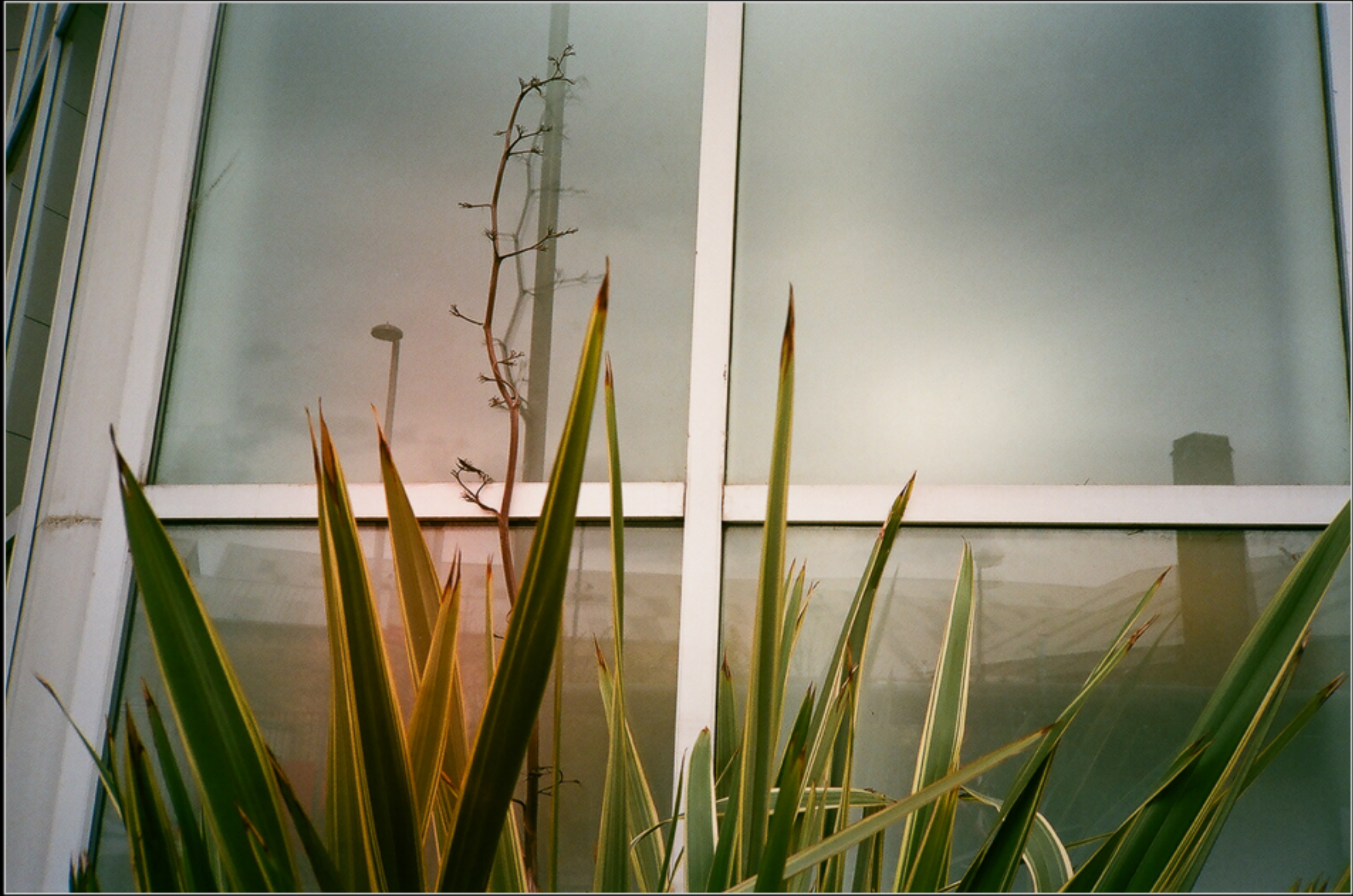
Leyton, London; 9th April