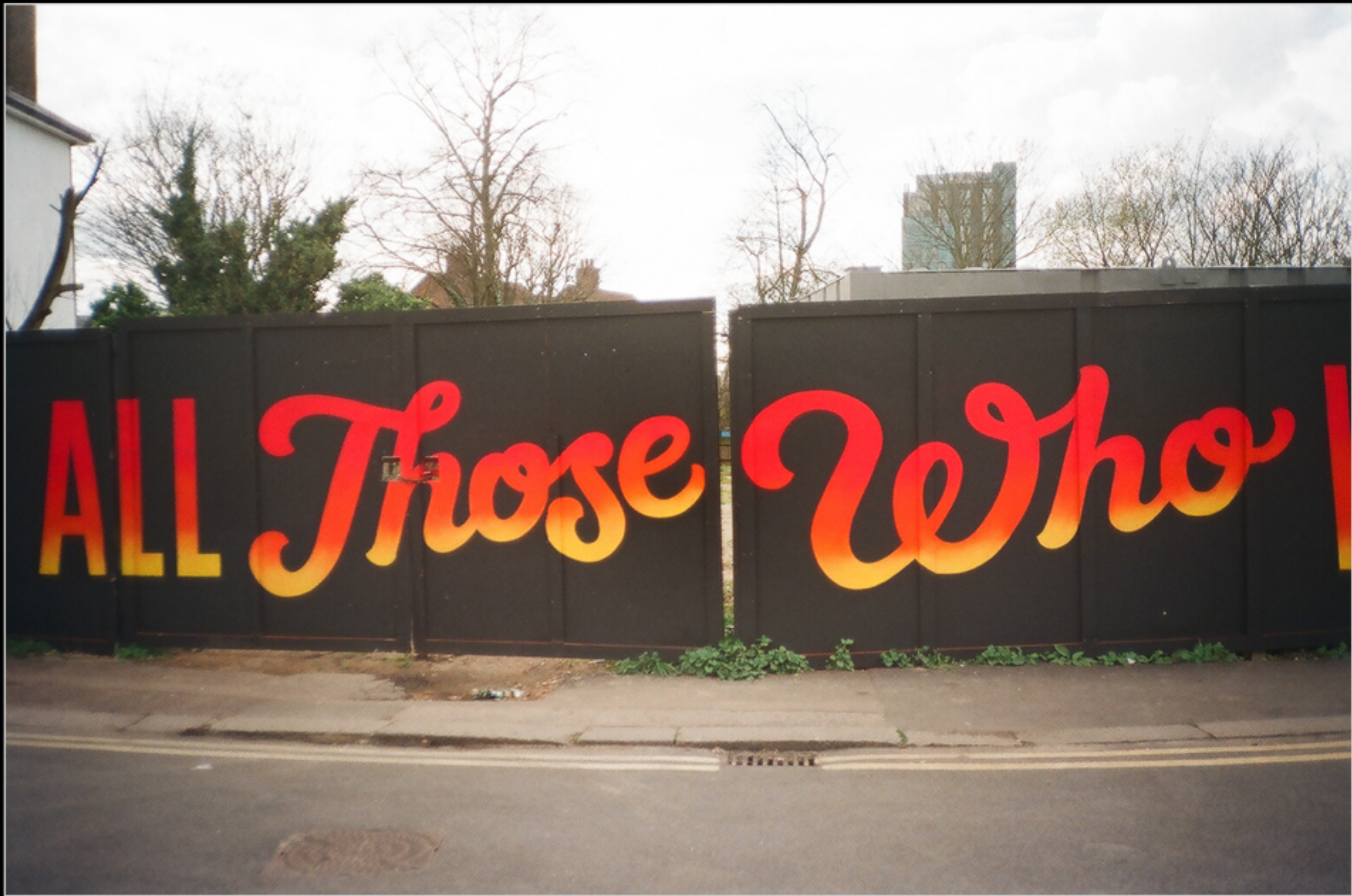
Walthamstow, London; 8th April