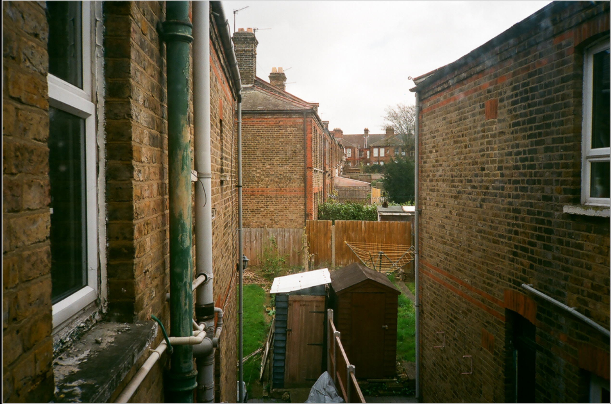
Walthamstow, London; 8th April