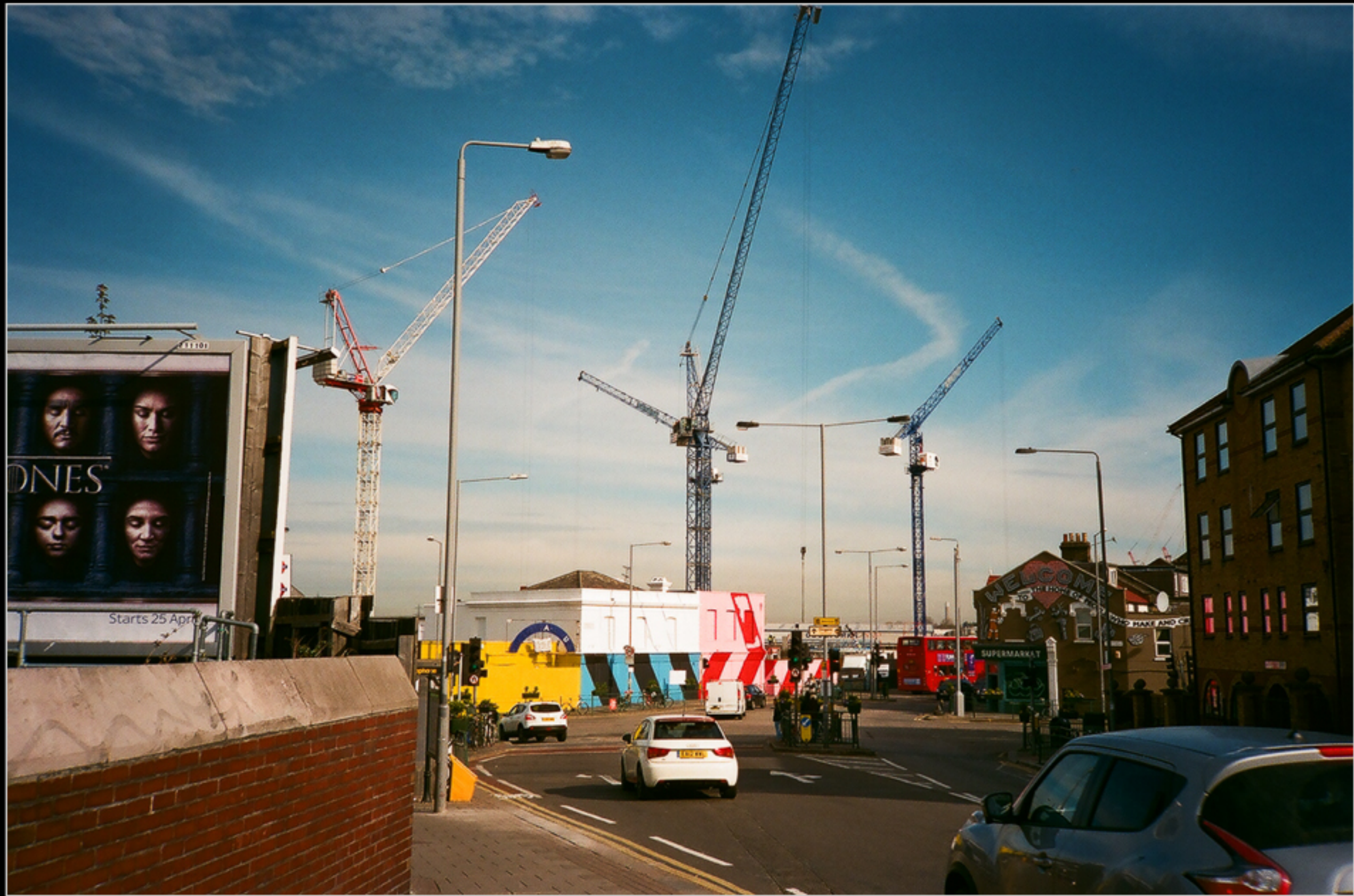
Walthamstow, London; 12th April