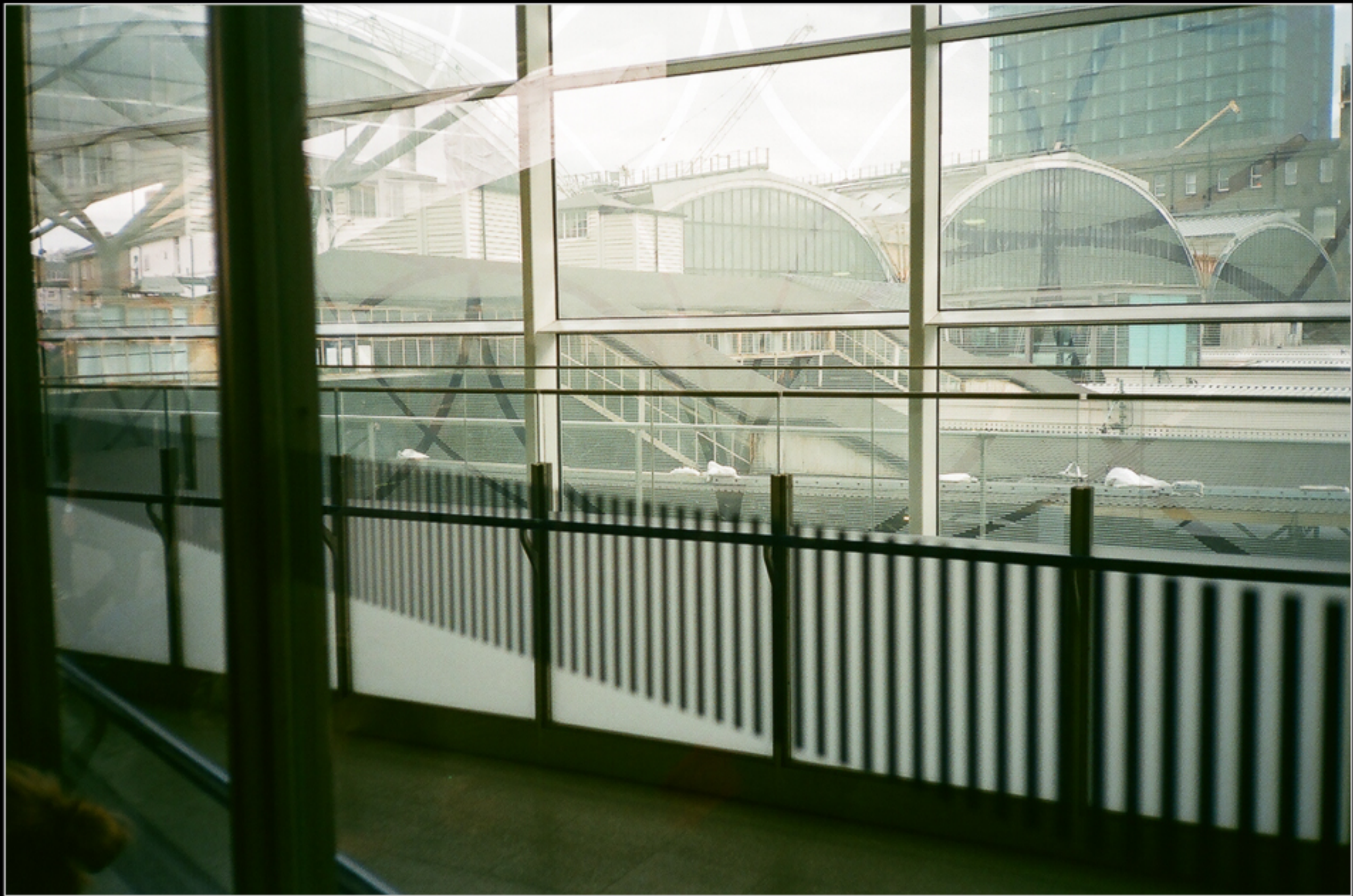
Paddington, London; 8th April